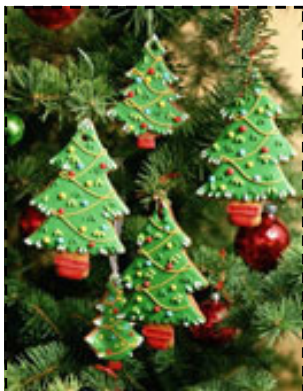
Orrville Lions Tale